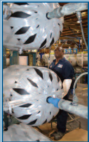
Highly trained technicians oversee FL tank winding being done on Flexcon's state-of-the-art automated filament winder.

Unlike other composite tanks that hide tired old bag technology in a plastic shell, the Flex-Lite FL composite tank uses the latest evolution of the field proven controlled action diaphragm design that Flexcon introduced in Well-Rite steel tanks in 1989.