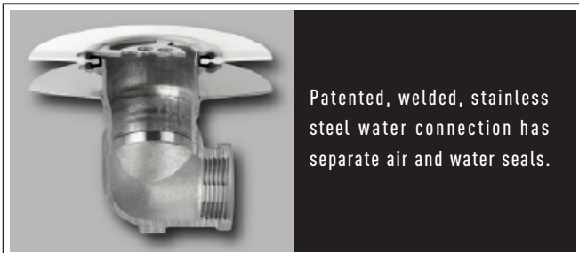
Patented, welded, stainless steel water connection has separate air and water seals.

Condensation-reducing design virtually eliminates external corrosion.