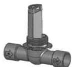
Tank bottom fitting 1 1/4" socket glue connections