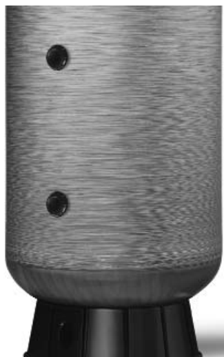
Flexport connections 1 1/4" FNPT (FLSD/H2PLSD Only)

Note: Use PVC cleaners and glue that are suitable for plastic connections. Make sure to follow manufacturer's recommendations for use and proper ventilation.