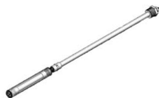
Air volume control kit Part # AVC Kit